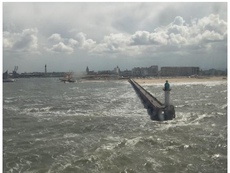
... a windy day with the white clouds flying... Entering Calais harbour (spring 2016)

From utmost east to utmost west, wherever feet have trod, by the mouth of many messengers goes forth the voice of God, 'Give ear to me, ye continents, ye isles, give ear to me, that the earth may be filled with the glory of God as the waters cover the sea.'