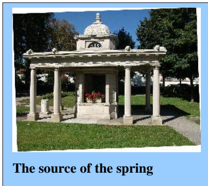
The source of the spring

The spa resort of Bourbonne-les-Bains is situated in a remarkably well-preserved natural environment, at the source of the River Meuse, on the border of the Lorraine, Franche-Comté and Burgundy regions. Bourbonne les Bains was a fashionable spa town in the 18 th and 19 th centuries. The Gallo-Romans discovered the healing properties of thermal waters and attributed them to the god Borvo (the god of hot springs) who gave its name to the spa town. . Where the simple Gaulish wooden bathing installations stood, the Romans harnessed and canalised the springs and built a well. The Romans who came to take the waters threw their votive offerings into the well, in recognition of the waters' beneficial effects. The spa resort became a flourishing, and even luxurious, place.